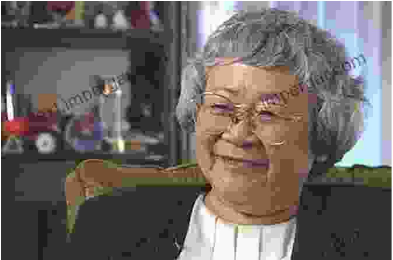
Monica Sone, Japanese American writer

examining how they have captured the complexities of immigration, identity, and cultural exchange. Through literary analysis and cultural commentary, the author illuminates the ways in which literature has shaped and reflected the evolving narrative of the Japanese American diaspora.