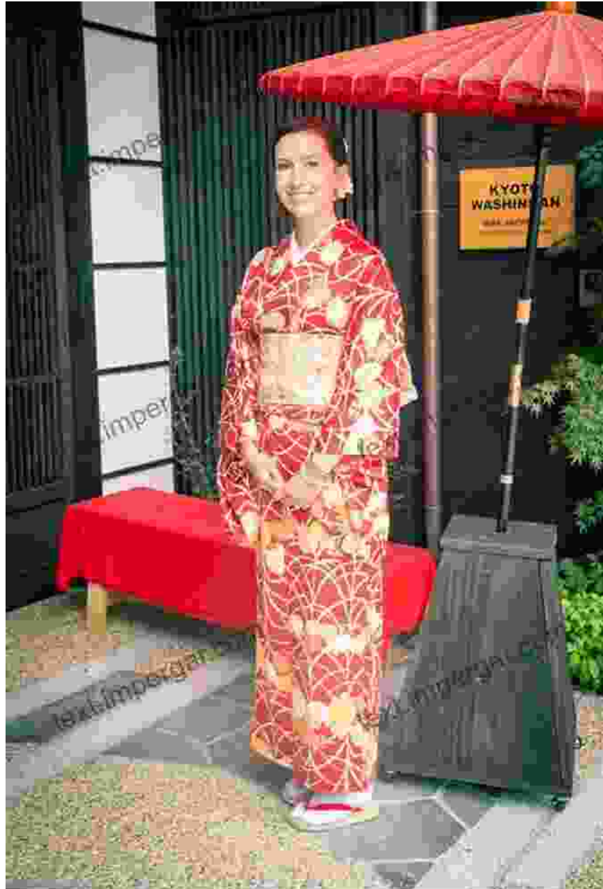
Japanese American woman wearing a kimono

Americans have expressed their cultural heritage through language, food, art, and social practices, creating a unique blend that transcends geographical boundaries.