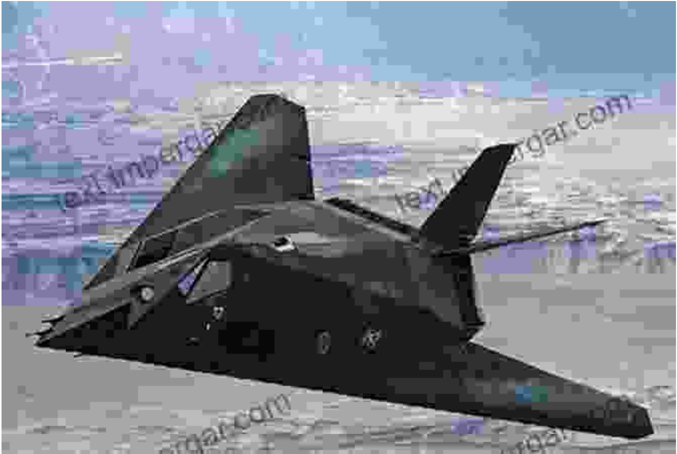
The Lockheed 117 Nighthawk Stealth Fighter in flight.