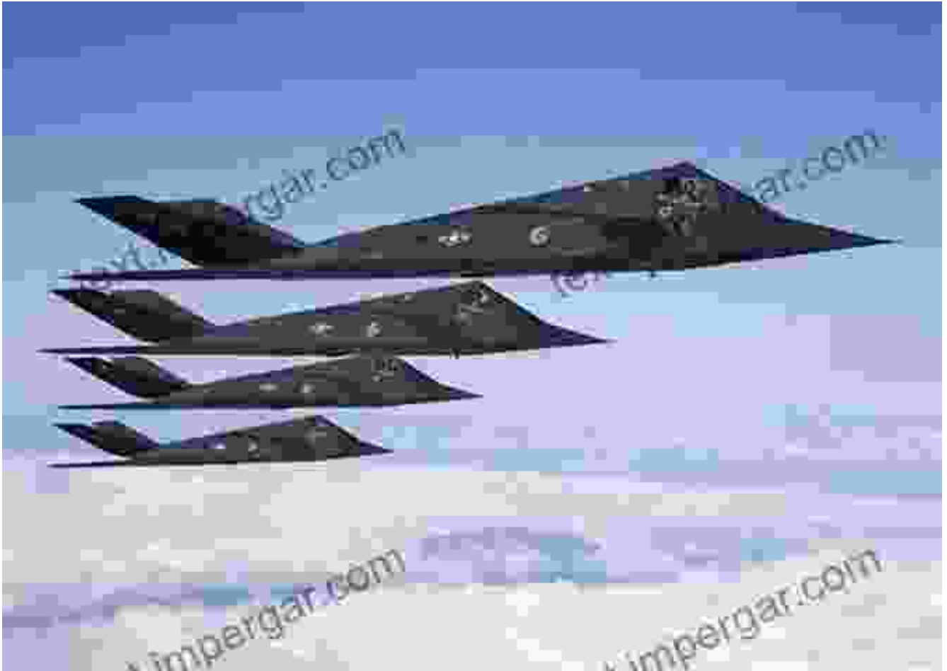
A Lockheed 117 Nighthawk Stealth Fighter flying in formation.