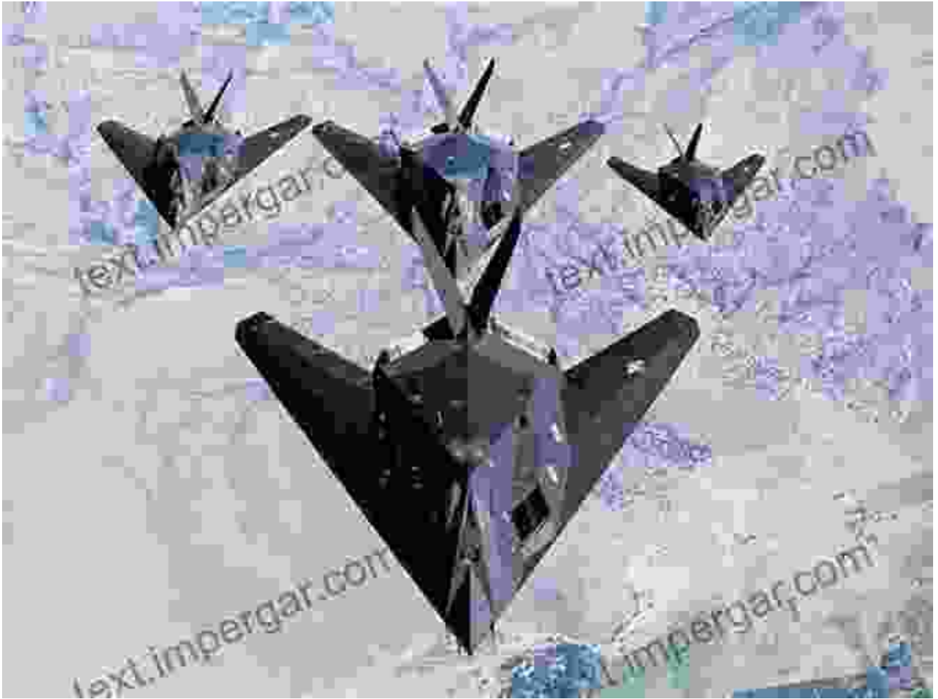
The Lockheed 117 Nighthawk Stealth Fighter on the runway.