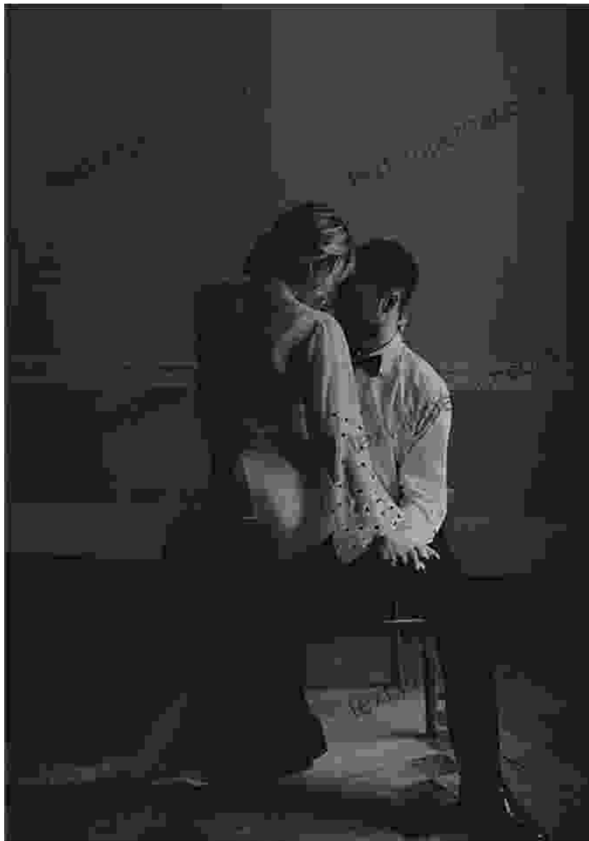
Blonde Army - Design & Hire for stylish weddings and events

Monochrome photography offers a unique opportunity for storytelling, allowing photographers to convey emotions, evoke memories, and share their perspectives with their audience. By stripping away color, monochrome images force viewers to focus on the subject's expressions, gestures, and surroundings, creating a deeper connection between the photographer and the viewer.